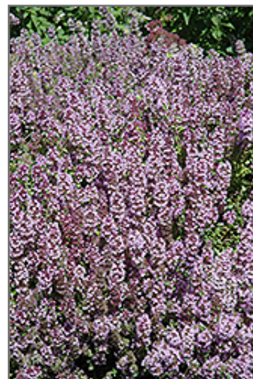
Mother-of-Thyme in bloom

Mother-of-Thyme is recommended for the following landscape applications;