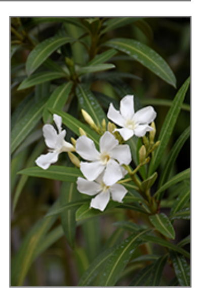
White Oleander flowers