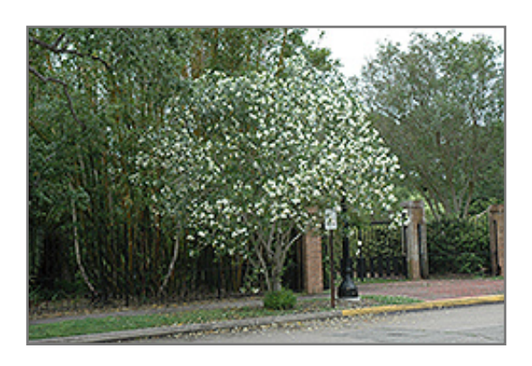
White Oleander in bloom