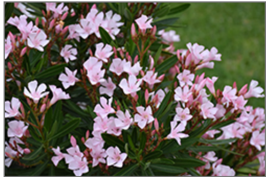
Petite Pink Oleander flowers