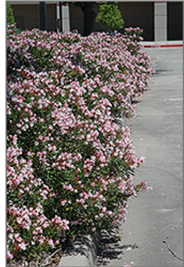
Petite Pink Oleander in bloom

This plant does best in full sun to partial shade. It is very adaptable to both dry and moist locations, and should do just fine under typical garden conditions. It is considered to be drought-tolerant, and thus makes an ideal choice for a low-water garden or xeriscape application. It is not particular as to soil pH, but grows best in poor soils, and is able to handle environmental salt. It is highly tolerant of urban pollution and will even thrive in inner city environments. This is a selected variety of a species not originally from North America, and parts of it are known to be toxic to humans and animals, so care should be exercised in planting it around children and pets.