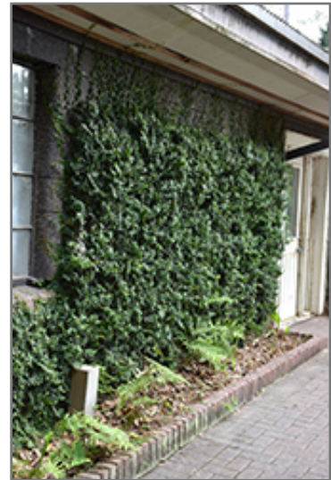
Creeping Fig

Creeping Fig is a fine choice for the garden, but it is also a good selection for planting in outdoor containers and hanging baskets. Because of its spreading habit of growth, it is ideally suited for use as a 'spiller' in the 'spiller-thriller-filler' container combination; plant it near the edges where it can spill gracefully over the pot. It is even sizeable enough that it can be grown alone in a suitable container. Note that when growing plants in outdoor containers and baskets, they may require more frequent waterings than they would in the yard or garden.