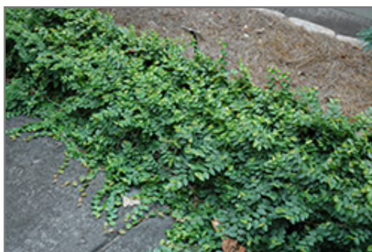
Creeping Fig