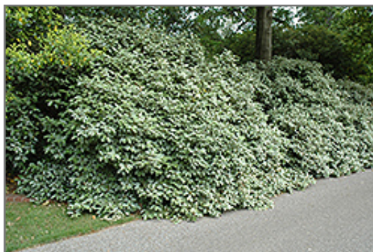
Fruitland Silverberry

Fruitland Silverberry will grow to be about 15 feet tall at maturity, with a spread of 15 feet. It has a low canopy, and is suitable for planting under power lines. It grows at a fast rate, and under ideal conditions can be expected to live for approximately 30 years.