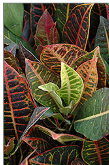
Variegated Croton foliage