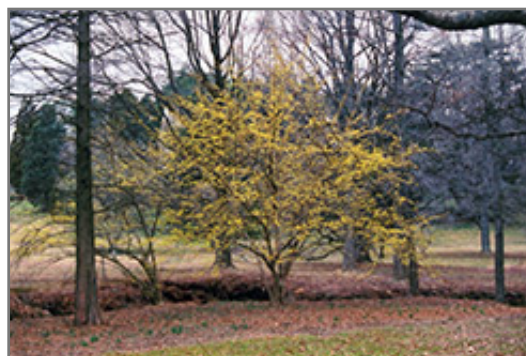
Japanese Cornelian Dogwood in bloom