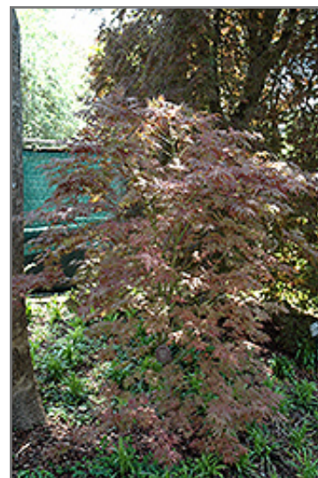
Mikazuki Japanese Maple