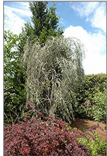
Weeping Myall