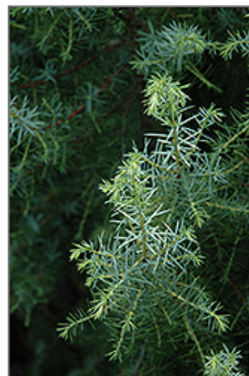
Kalebab Juniper foliage