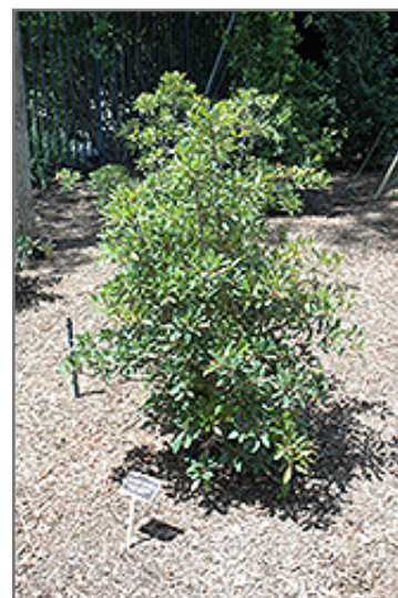
Bronze Beauty Cleyera