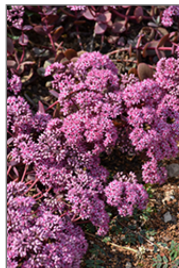
Cherry Tart Stonecrop flowers

Cherry Tart Stonecrop is a fine choice for the garden, but it is also a good selection for planting in outdoor pots and containers. It is often used as a 'filler' in the 'spiller-thriller-filler' container combination, providing a mass of flowers and foliage against which the larger thriller plants stand out. Note that when growing plants in outdoor containers and baskets, they may require more frequent waterings than they would in the yard or garden.