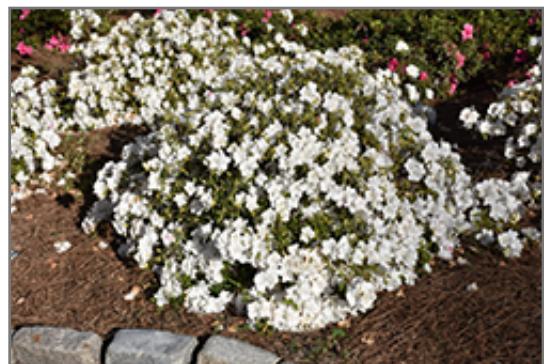
Encore Autumn Starlite Azalea in bloom