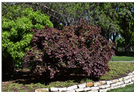
Suzanne Chinese Fringeflower