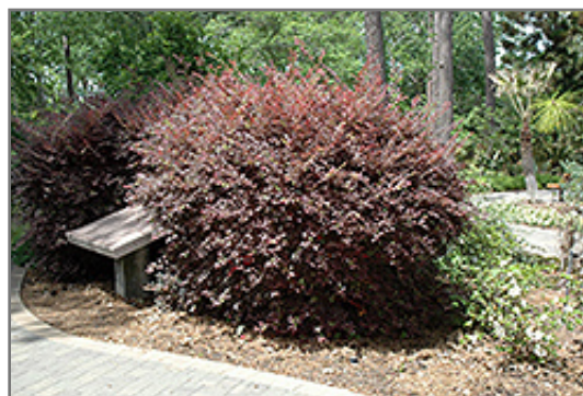
Daruma Chinese Fringeflower