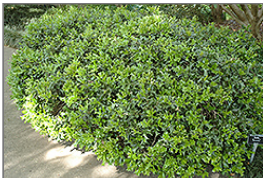
Rotunda Chinese Holly