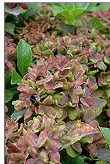
Pistachio Hydrangea flowers