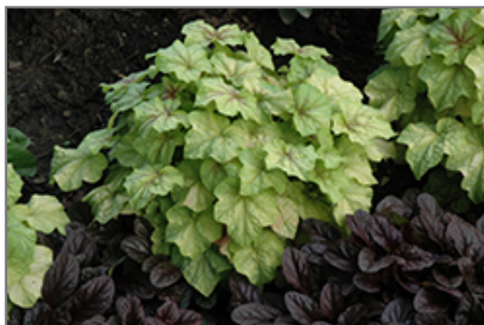
Fire Frost Foamy Bells

Fire Frost Foamy Bells is recommended for the following landscape applications;