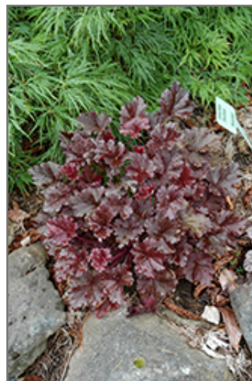
Dark Secret Coral Bells

Dark Secret Coral Bells is recommended for the following landscape applications;