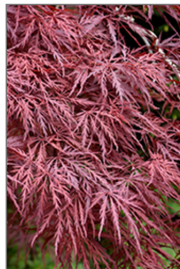
Red Dragon Japanese Maple foliage