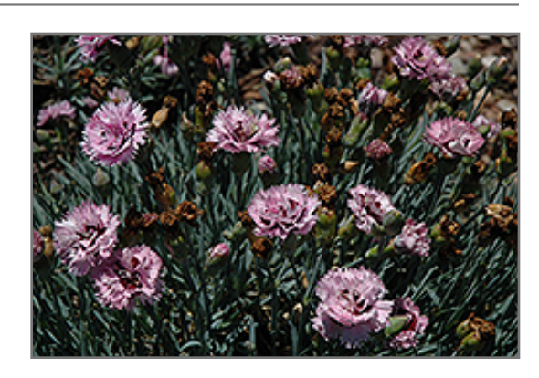
Veronica Skagit Pinks flowers