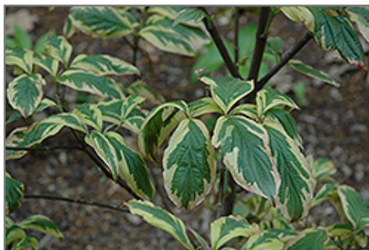
Firebird Flowering Dogwood foliage