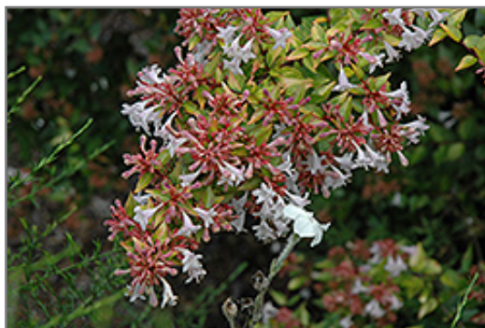
Francis Mason Abelia flowers