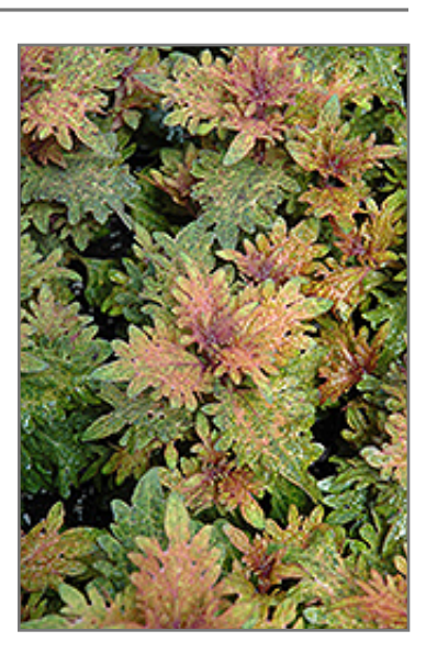
Limon Blush Coleus foliage

Limon Blush Coleus will grow to be about 30 inches tall at maturity, with a spread of 24 inches. When grown in masses or used as a bedding plant, individual plants should be spaced approximately 20 inches apart. Although it's not a true annual, this fast-growing plant can be expected to behave as an annual in our climate if left outdoors over the winter, usually needing replacement the following year. As such, gardeners should take into consideration that it will perform differently than it would in its native habitat.