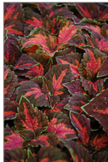
Superfine Rainbow Festive Dance Coleus foliage