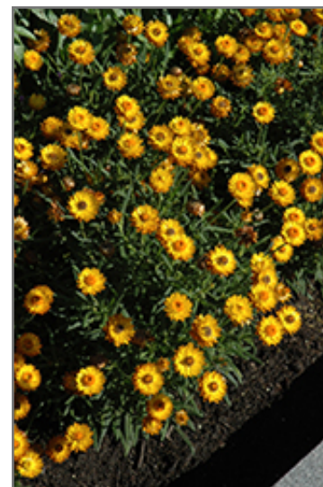
Sundaze Golden Beauty Strawflower in bloom