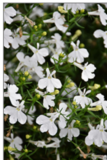
Bella Bianca Lobelia flowers