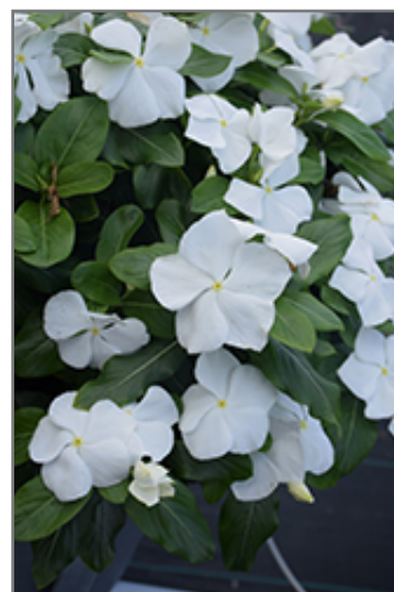
Titan Pure White Vinca flowers

Titan Pure White Vinca is recommended for the following landscape applications;