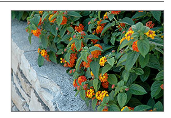
Lucky Red Flame Lantana flowers

A bright, very adaptable, and everblooming selection, producing loads of flower clusters; excellent performance in temperature extremes; impressive when massed, and great for containers