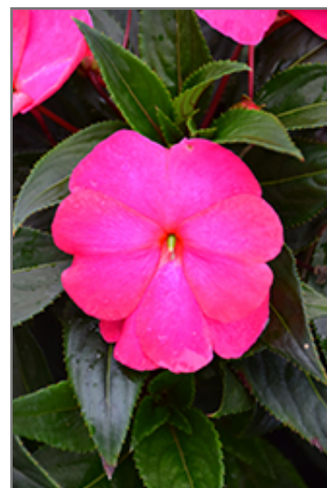
Super Sonic Hot Pink New Guinea Impatiens flowers