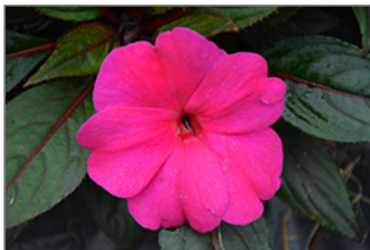
Magnum Blue New Guinea Impatiens flowers