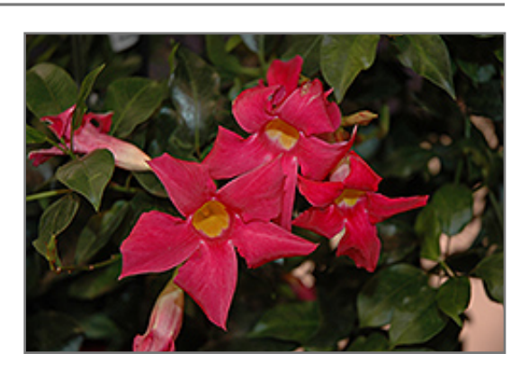
Sun Parasol Pretty Deep Pink Mandevilla flowers

Large, elegant blooms appear on this vigorous, twining vine from early summer until fall; large, deep green foliage serves as the perfect contrast; great for arbors, garden walls, containers or baskets