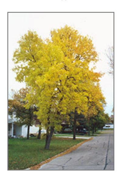
Green Ash in fall