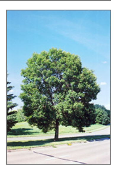
Green Ash