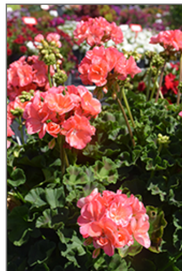
Dynamo Salmon Geranium flowers