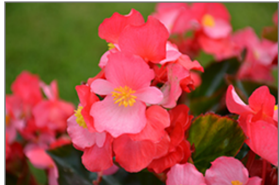
Surefire Rose Begonia flowers