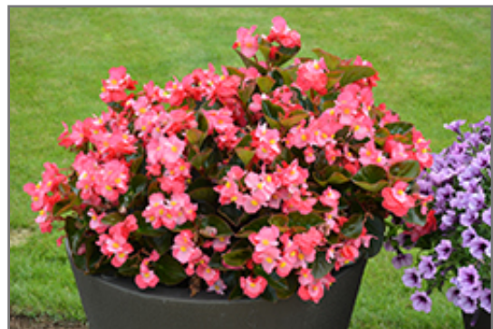
Surefire Rose Begonia in bloom