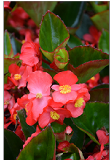
Surefire Red Begonia flowers