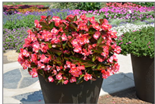
Surefire Red Begonia in bloom