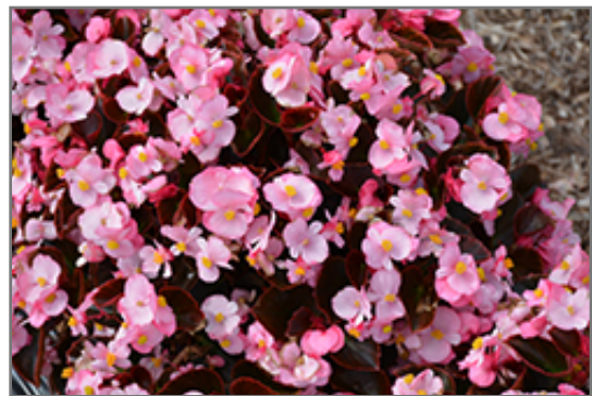
Nightife Pink Begonia flowers