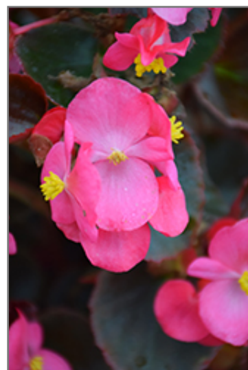
Bada Boom Rose Begonia flowers

Bada Boom Rose Begonia is recommended for the following landscape applications;