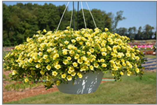
Million Bells Trailing Yellow Calibrachoa in bloom

Million Bells Trailing Yellow Calibrachoa is a fine choice for the garden, but it is also a good selection for planting in outdoor containers and hanging baskets. Because of its trailing habit of growth, it is ideally suited for use as a 'spiller' in the 'spiller-thriller-filler' container combination; plant it near the edges where it can spill gracefully over the pot. It is even sizeable enough that it can be grown alone in a suitable container. Note that when growing plants in outdoor containers and baskets, they may require more frequent waterings than they would in the yard or garden.