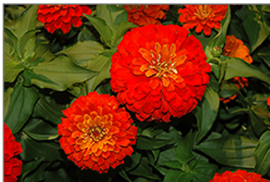
Dreamland Scarlet Zinnia flowers