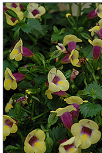
Yellow Moon Torenia flowers

Yellow Moon Torenia is recommended for the following landscape applications;