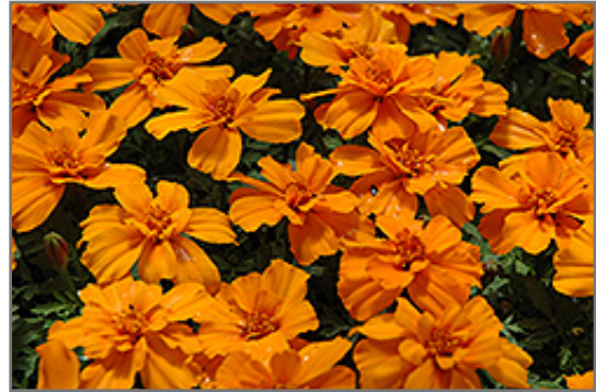
Safari Tangerine Marigold flowers