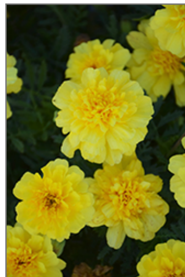
Alumia Yellow Marigold flowers

Alumia Yellow Marigold will grow to be about 12 inches tall at maturity, with a spread of 12 inches. When grown in masses or used as a bedding plant, individual plants should be spaced approximately 10 inches apart. Its foliage tends to remain dense right to the ground, not requiring facer plants in front. This fast-growing annual will normally live for one full growing season, needing replacement the following year.