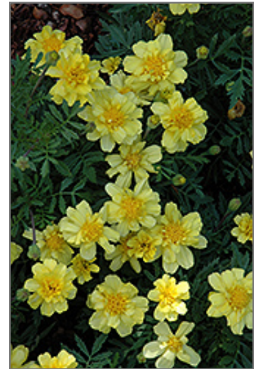
Alumia Vanilla Cream Marigold flowers