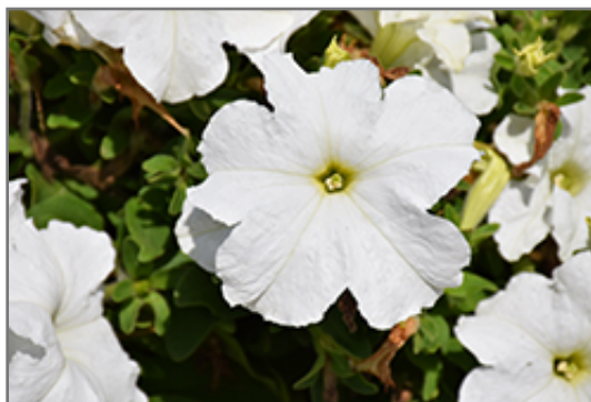
EZ Rider White Petunia flowers