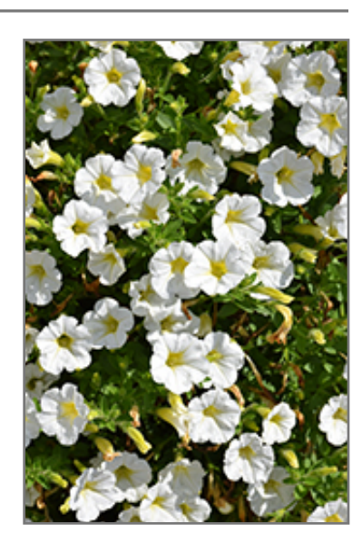
Littletunia White Grace Petunia flowers

Littletunia White Grace Petunia will grow to be about 12 inches tall at maturity, with a spread of 12 inches. When grown in masses or used as a bedding plant, individual plants should be spaced approximately 10 inches apart. Its foliage tends to remain dense right to the ground, not requiring facer plants in front. This fast-growing annual will normally live for one full growing season, needing replacement the following year.