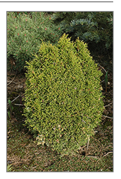
Boisbriand Arborvitae

Boisbriand Arborvitae will grow to be about 9 feet tall at maturity, with a spread of 4 feet. It tends to fill out right to the ground and therefore doesn't necessarily require facer plants in front, and is suitable for planting under power lines. It grows at a slow rate, and under ideal conditions can be expected to live for approximately 30 years.