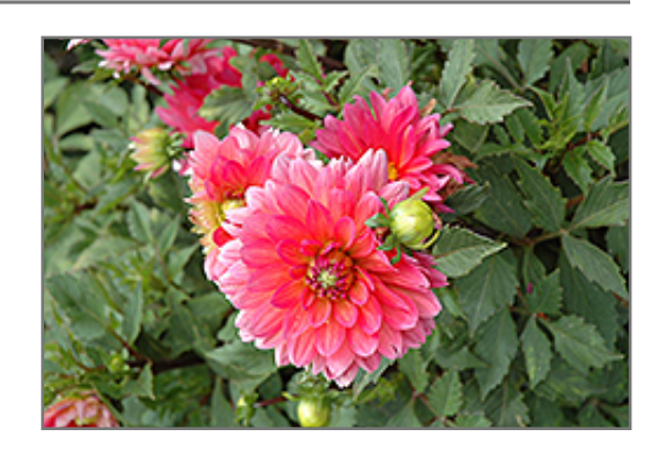
Karma Fuchsiana Dahlia flowers

Karma Fuchsiana Dahlia will grow to be about 30 inches tall at maturity, with a spread of 24 inches. The flower stalks can be weak and so it may require staking in exposed sites or excessively rich soils. Although it's not a true annual, this plant can be expected to behave as an annual in our climate if left outdoors over the winter, usually needing replacement the following year. As such, gardeners should take into consideration that it will perform differently than it would in its native habitat.