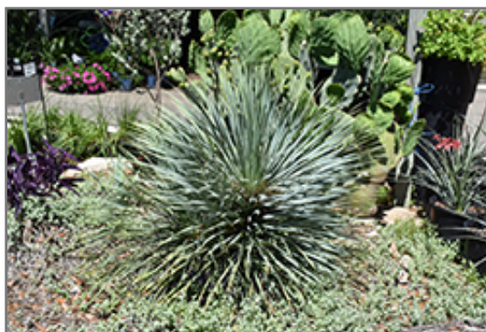
Beaked Yucca