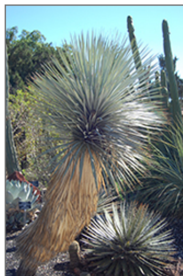
Beaked Yucca