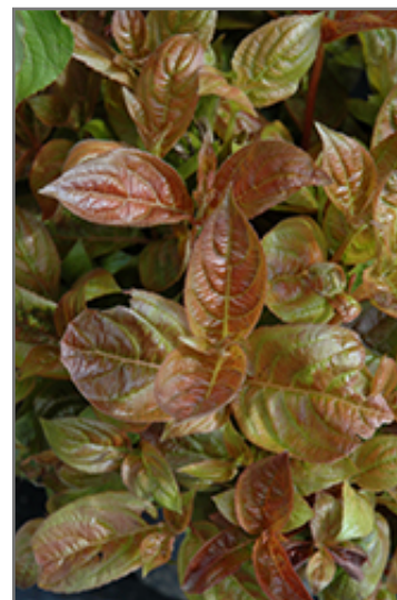
Wings Of Fire Weigela foliage